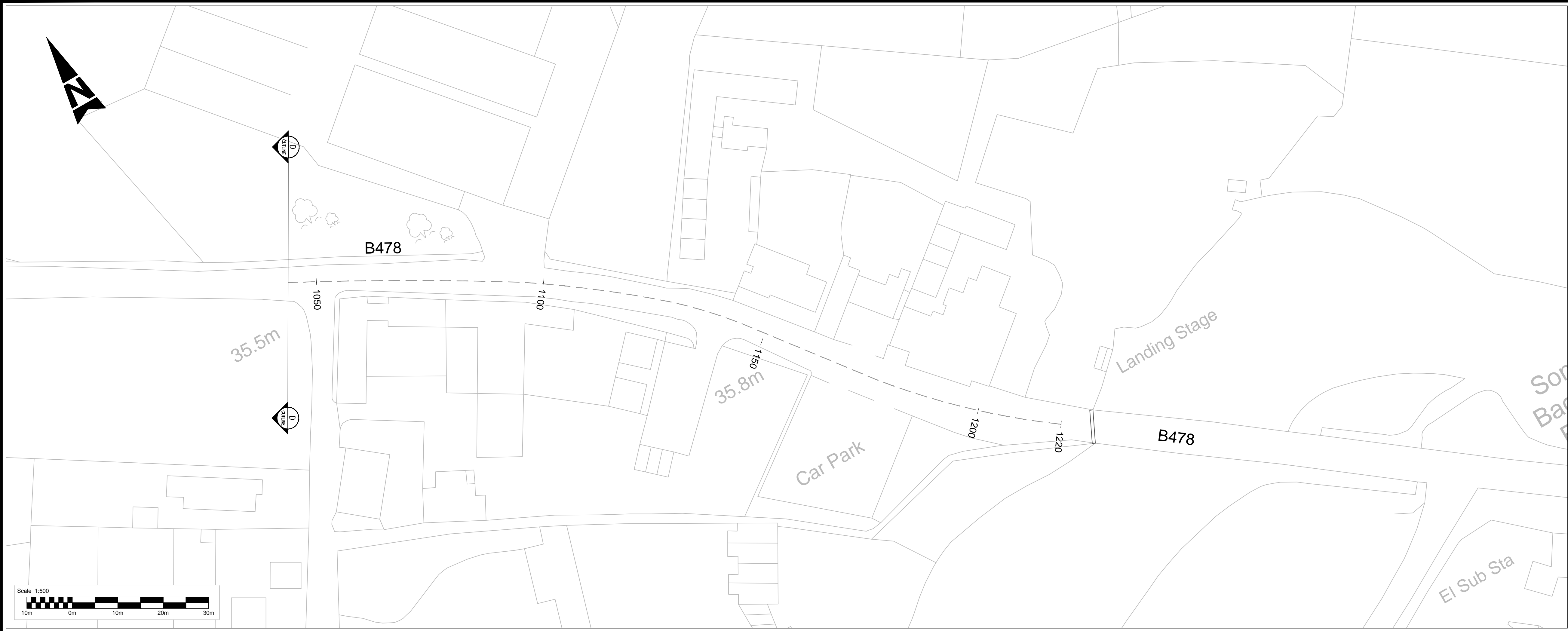
LONG SECTION - CHAINAGE 1040-1220 SCALE - HORIZONTAL 1:500 / VERTICAL 1:50

P:\GBCMA\Hand\TTSol\AI\Projects\5150173-Playhatch_Road\CON\459\12 CAD_BIM\01 WIP\DR - Drawing Files\S-5150173-FEA-000-011.dwg